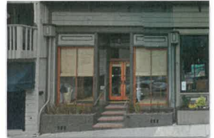
Pacific Grove 211 Grand Avenue Pacific Grove, CA 93950