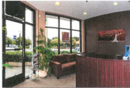
Felton 6287 Highway 9 Felton, CA 95018