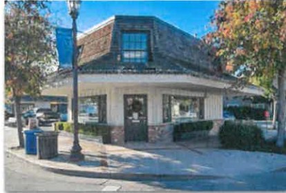
Capitola Village 301 Capitola Avenue Capitola, CA 95010