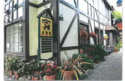
Carmel, Lincoln Morgan Court on Lincoln St Between Ocean & 7th Carmel-by-the-Sea, CA 93921