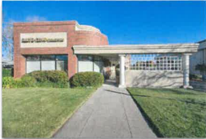
Capitola Main 2170 41st Avenue Capitola, CA 95010

10 OFFICES CONVENIENTLY LOCATED THROUGHOUT THE MONTEREY BAY