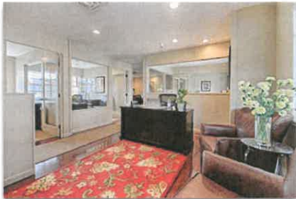
Carmel, San Carlos Upstairs in Hampton Court SW Corner of 7th & San Carlos Carmel-by-the-Sea, CA 93921